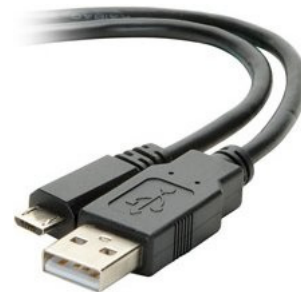
Type A to Micro-B cable (2444B5)